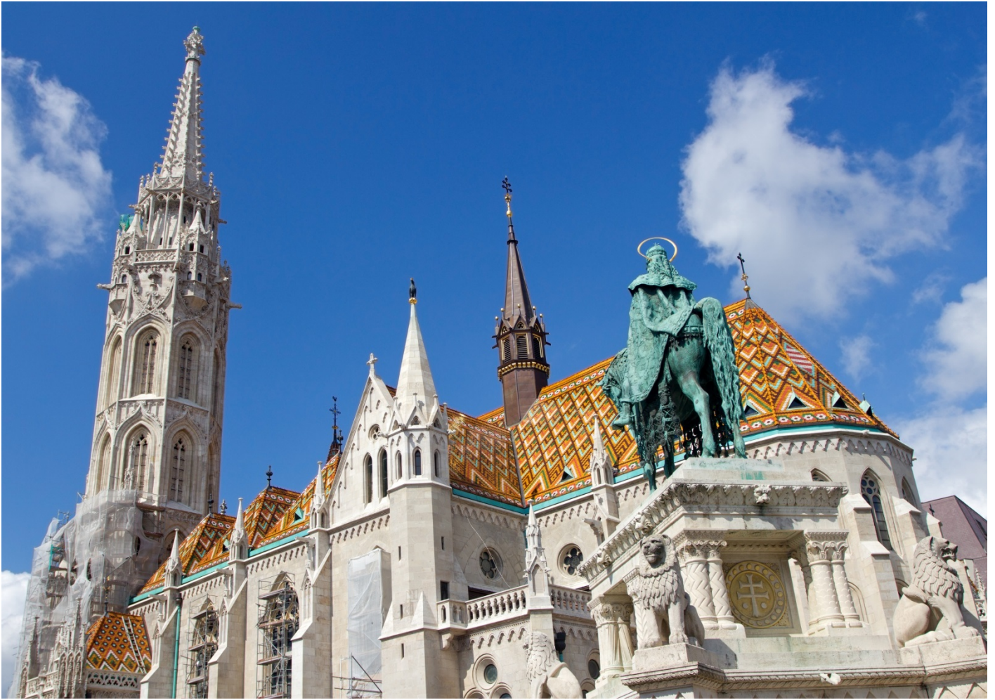
St Mátvás Church & St István's Monument