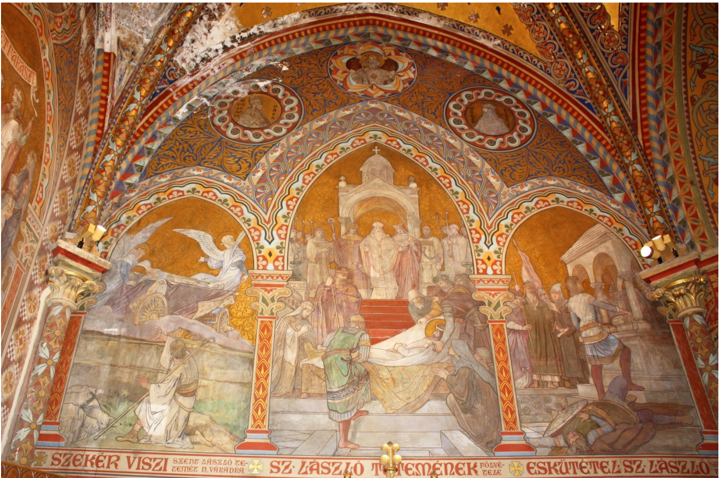
St Mátvás Church Interior