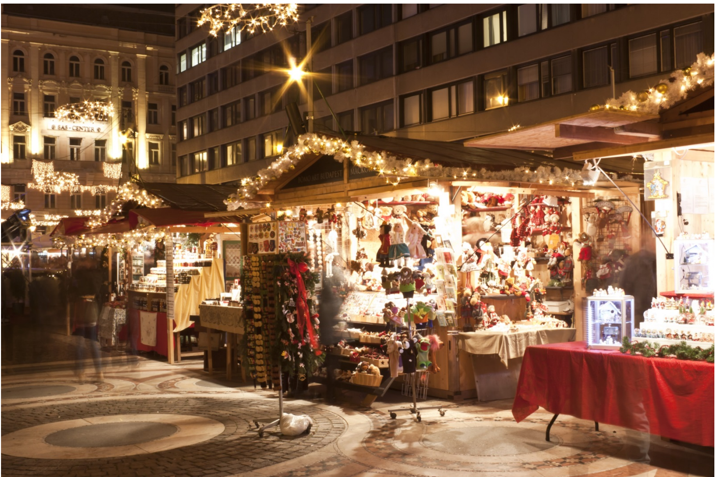
St István's Square Christmas Market