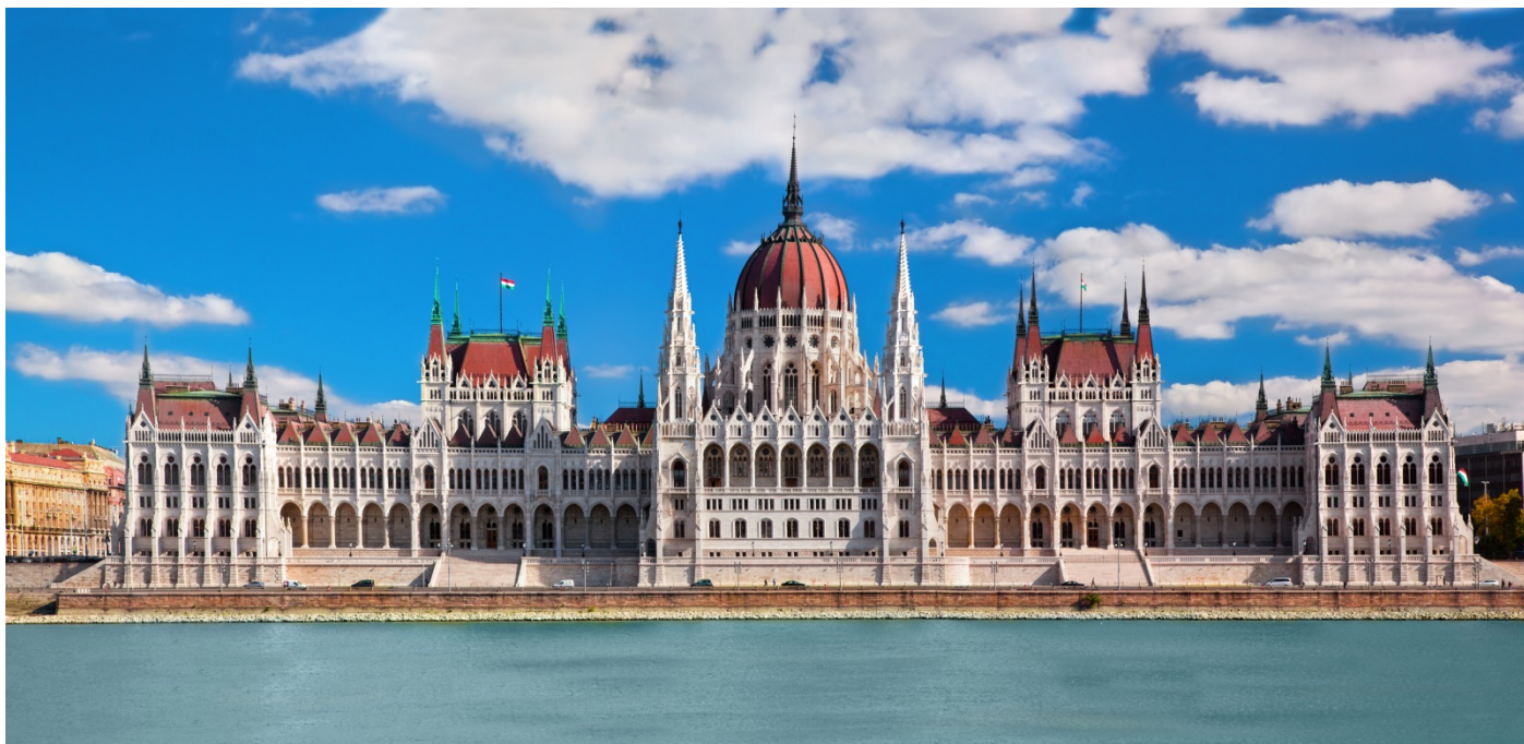
The Hungarian National Parliament Building