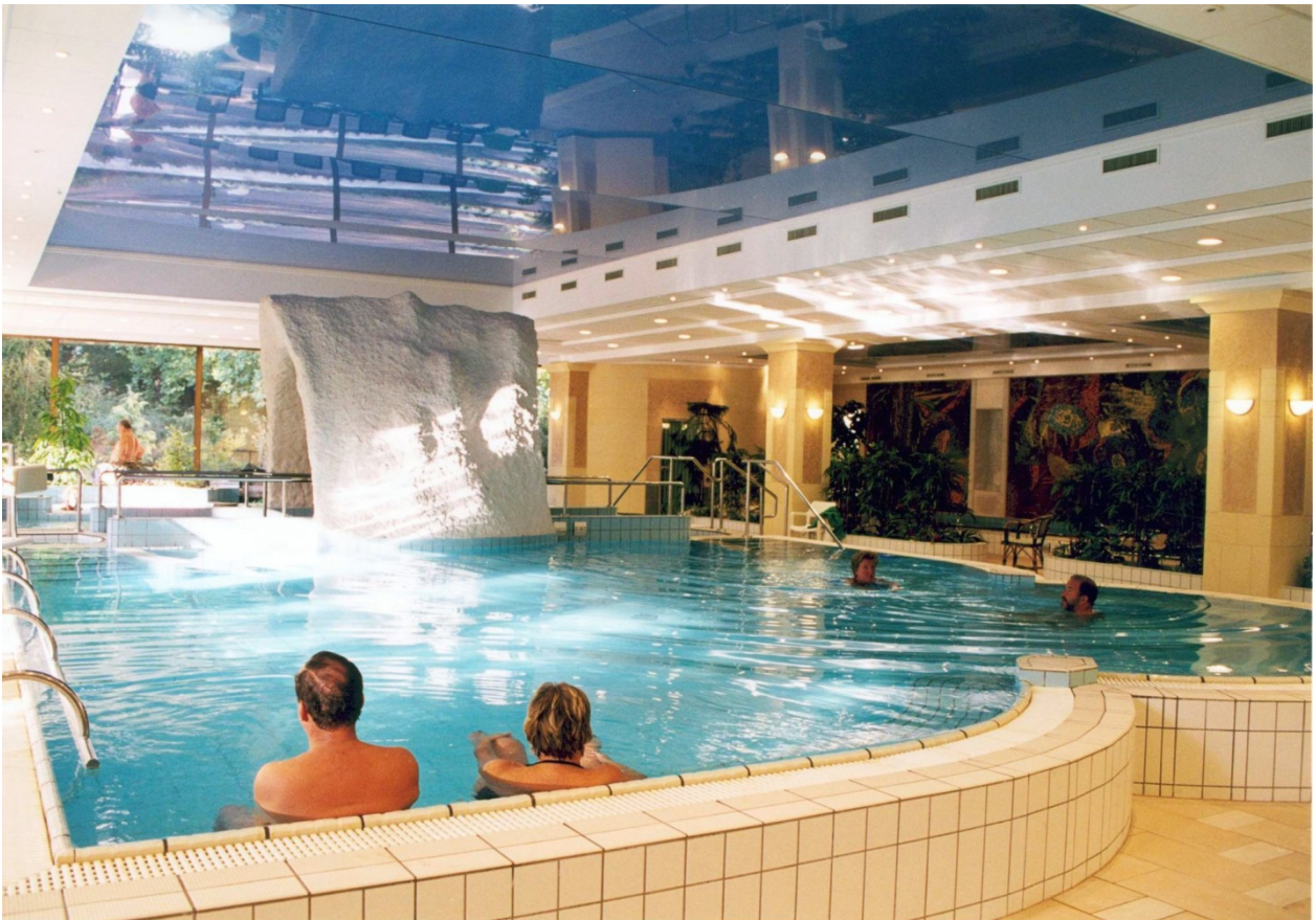
The Thermal Pool 36-38°C