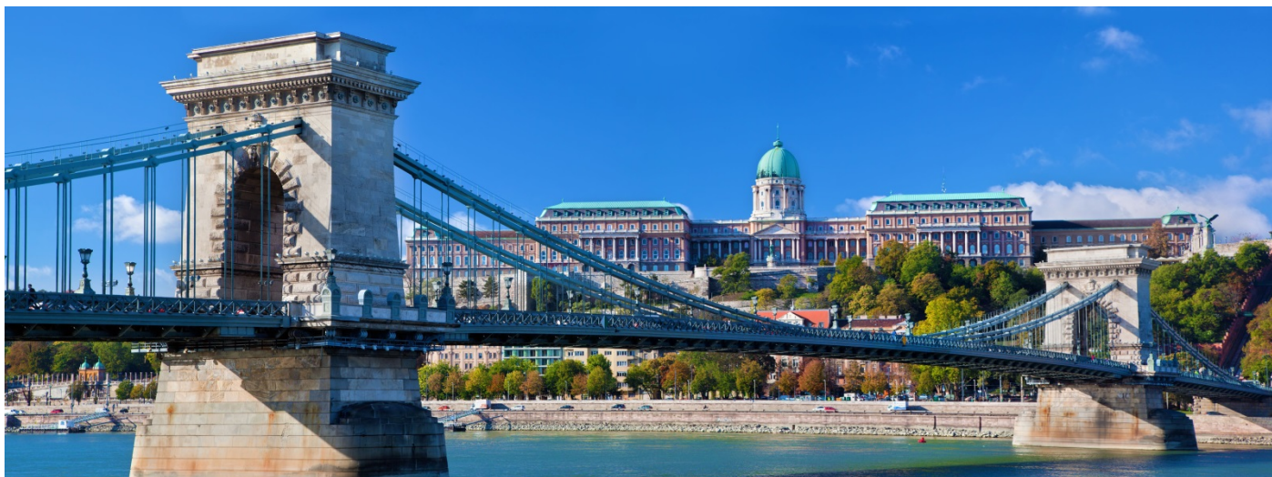
Széchenyi Chain Bridge & Buda Castle

Remarkably it is an amalgam of three formerly independent cities, each dating from a different period, and each retaining a distinctive historical character. Óbuda, or 'Old Buda', was an ancient pre-Roman settlement that was developed by the Romans into a provincial capital known as Aquincum (the remains of the amphitheatre and other buildings can still be visited). Buda was then built as a fortified citadel in the Middle Ages in reaction to a devastating invasion by Mongol tribes. Pest meanwhile, having been largely destroyed in drastic flooding in 1838, has largely a 19 th -century feel to it, and is characterized by grandiose buildings and expansive avenues. The three cities were unified as Budapest, the second most significant city within the Austro-Hungarian Empire, in 1873.