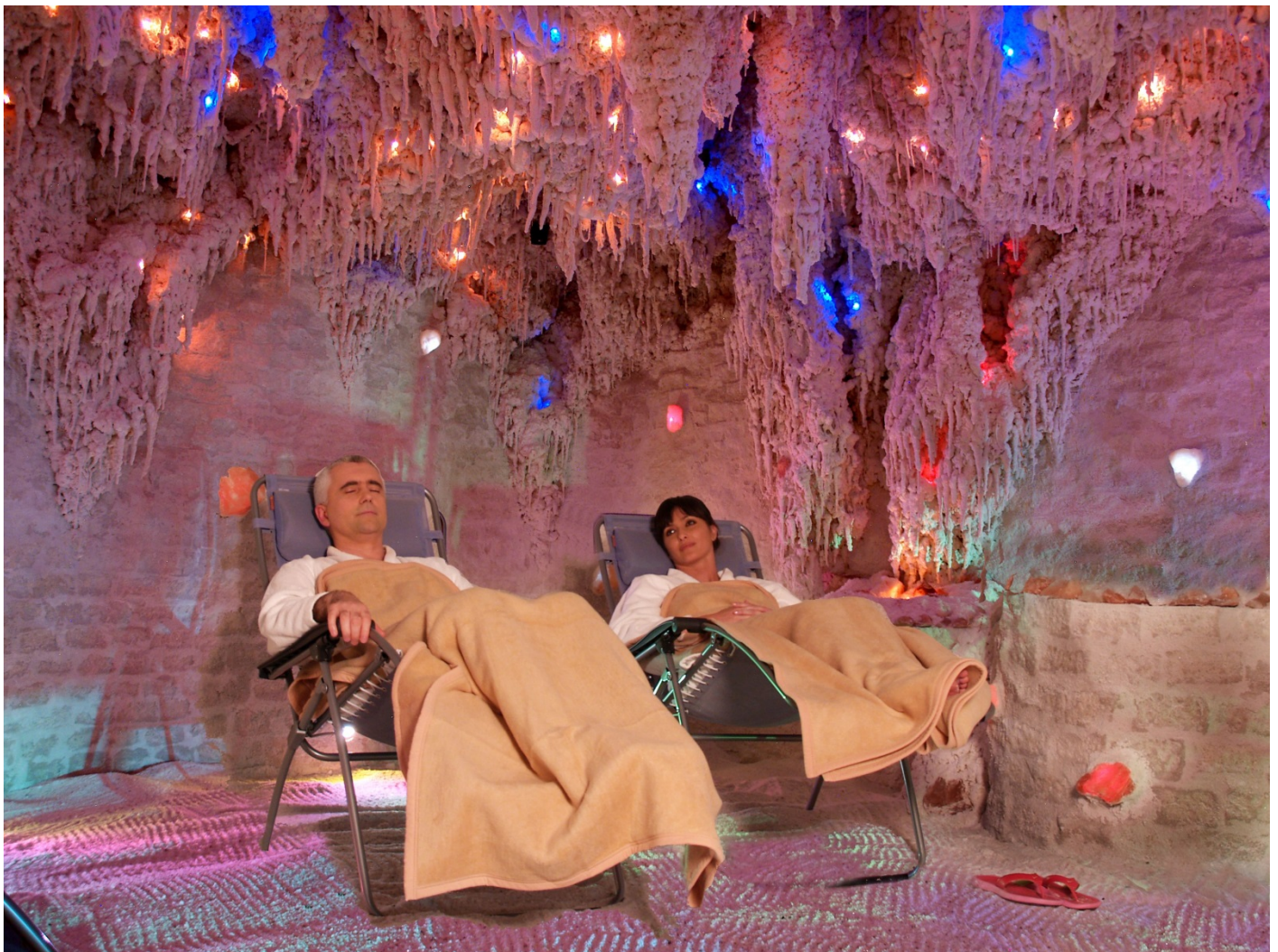
The Danubius Health Spa Resort Salt Cave

The hotel's extensive spa facilities include a large indoor pool (27-28°C), a vast thermal bath (36-38°C), a sauna, a steam cabin, an aroma cabin, and a salt cave (constructed from Dead Sea salt). A wide range of health and beauty treatments are also available.