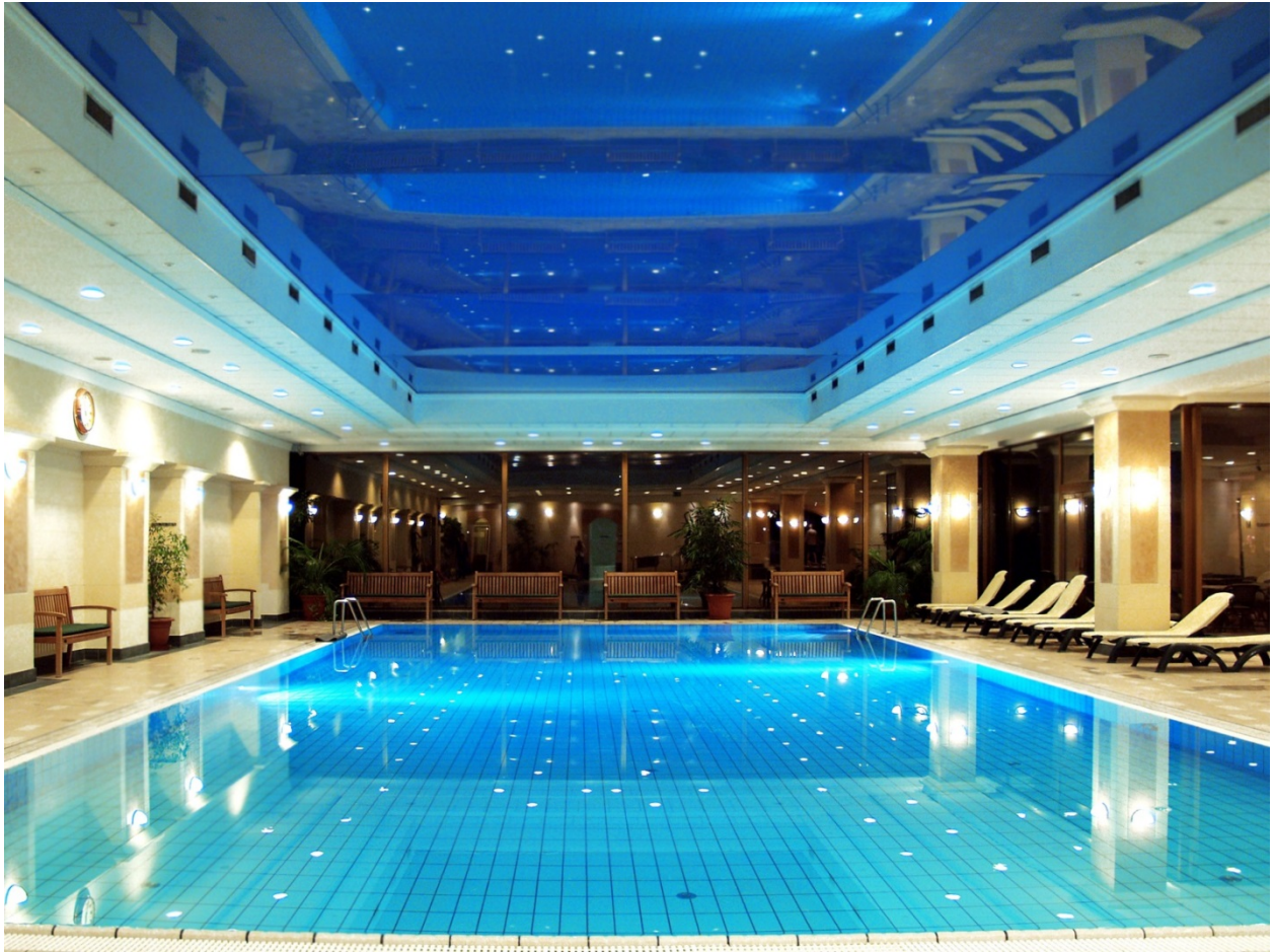
The Heated Indoor Pool 27-28°C