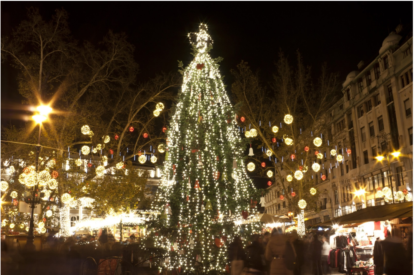
Vörösmarty Square Christmas Market