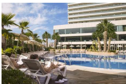
The Outdoor Pool