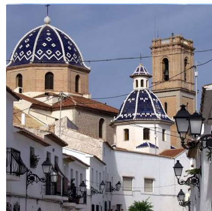
Altea's Crowning Glory

Altea & The Bay Of Altea – One of the most beautiful coastal hilltop towns in the Costa Blanca region, Altea is crowned by a strikingly picturesque ‘mother church’ with an attractive and highly characteristic blue and white roof tiling typical of the Valencia & Alicante provinces. The square in which the church sits contains a variety of bars and restaurants, and a number of interesting shops can also be found in the narrow medieval streets that lead off the square. On the headland that closes the Bay of Altea stands Albir lighthouse, offering spectacular views of the bay, Altea itself, and the imposing Bernia mountain range beyond.