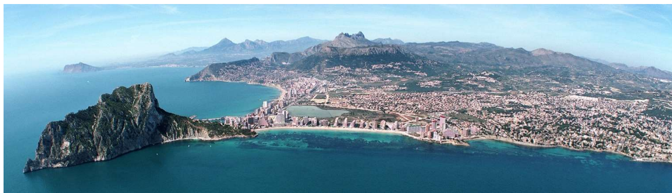
Calpe's Beautiful Beaches & Surrounding Mountains From The Air