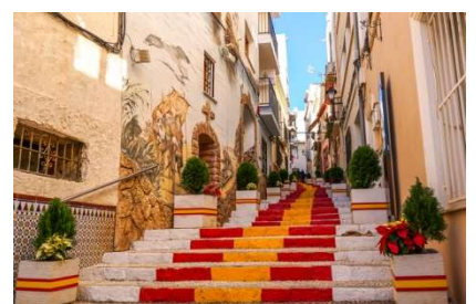
Calpe Old Town