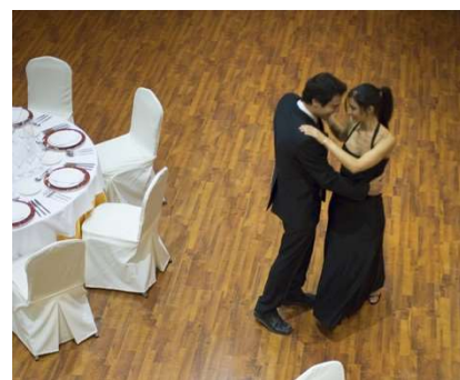
The Diamante Beach Ballroom

£50 off & a free health club pass if booked by 31.03.2025