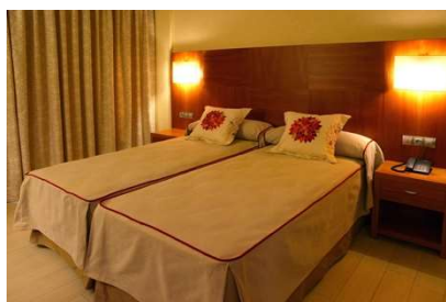
Elegantly Appointed Rooms